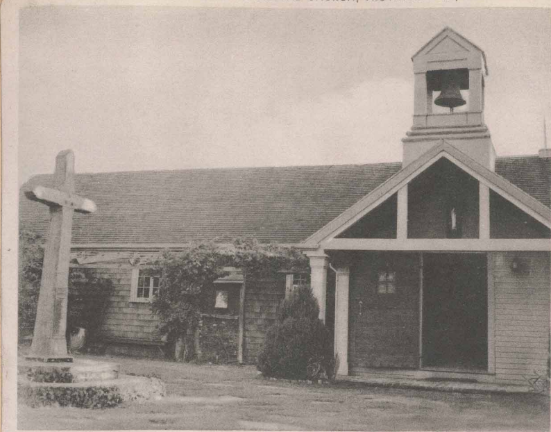
"ST. MARY'S OF THE HARBOR" EPISCOPAL CHURCH, PROVINCETOWN, MASS.