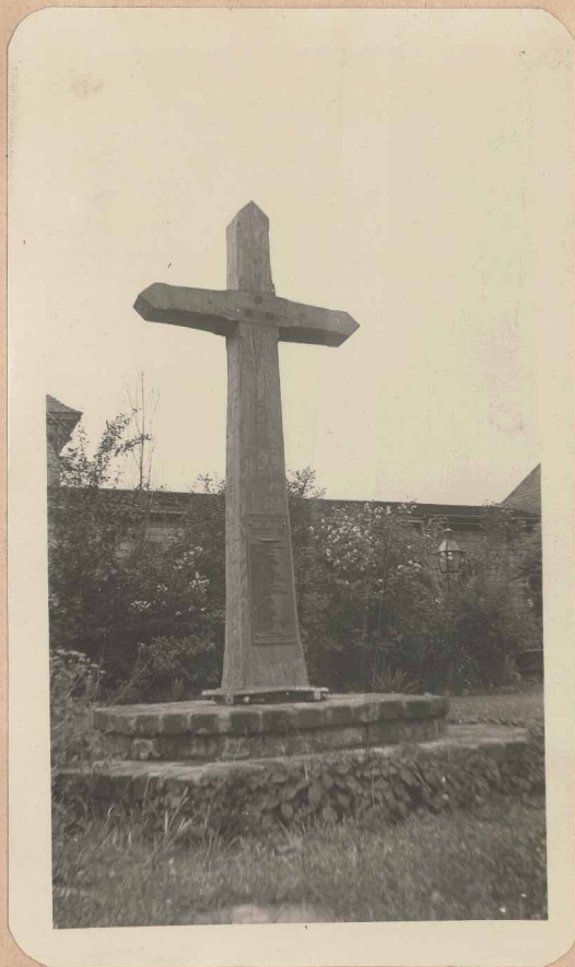
The Wooden Cross Commemorating the Loss of the Submarine S-4 off Wood End, December 17, 1927. (see pictures in Wood End section). Taken July 1941