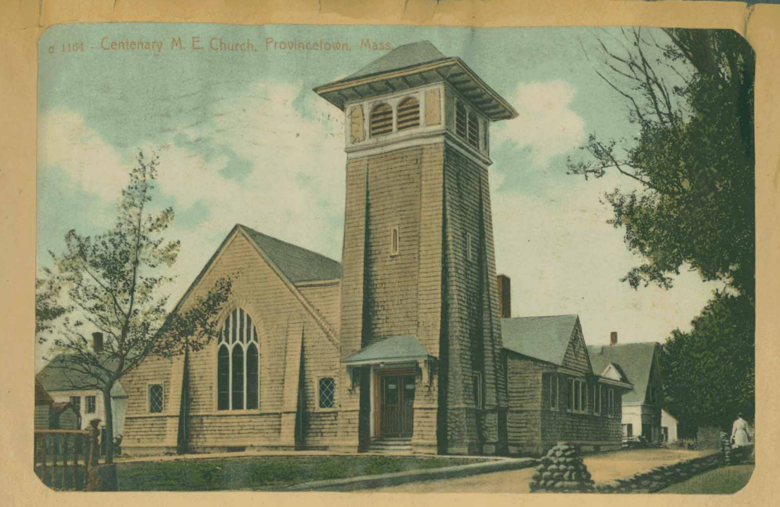
The new Church in the same spot, dedicated Nov. 7, 1909. This year (1946) this church is not in use.