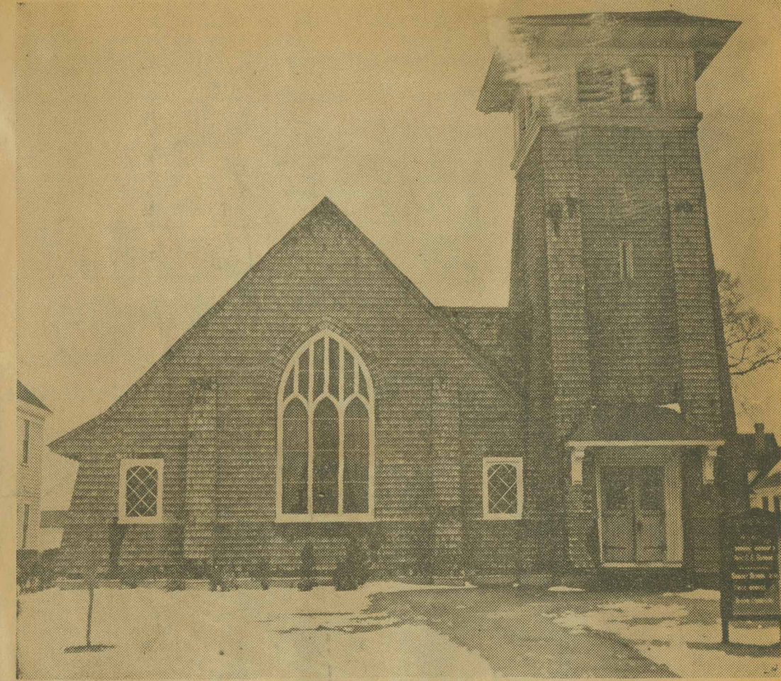
CENTENARY METHODIST CHURCH