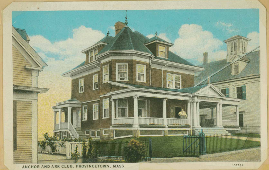
ANCHOR AND ARK CLUB, PROVINCETOWN, MASS.