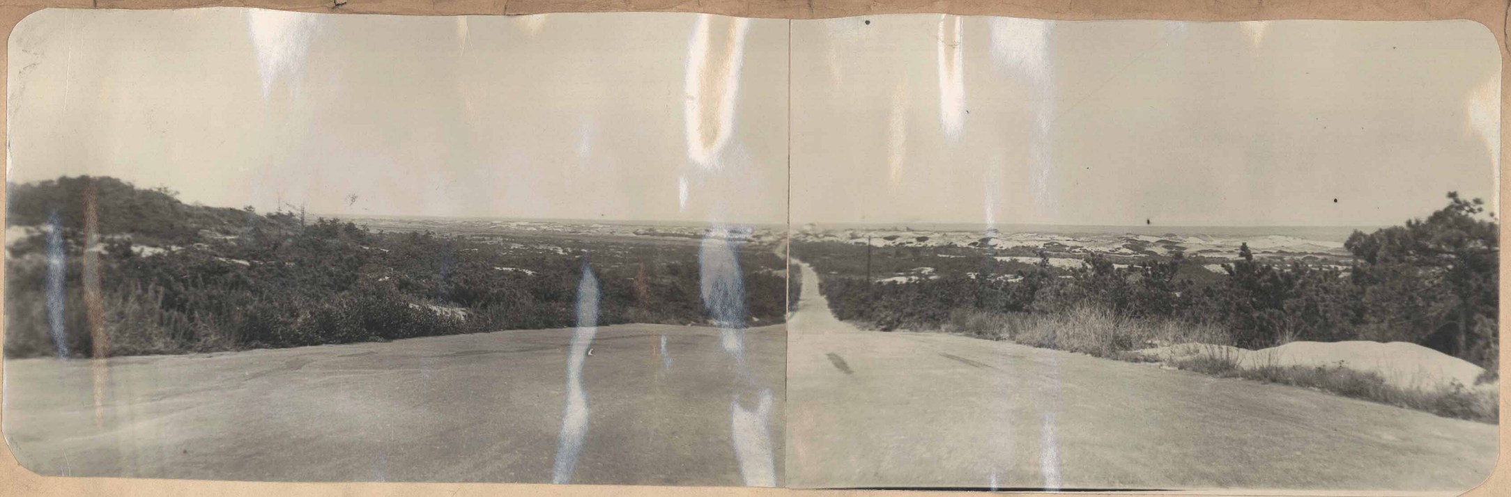
Another view of the Race Point Coast Guard Station from Sunset Hill. Taken by Althea, September 1945.