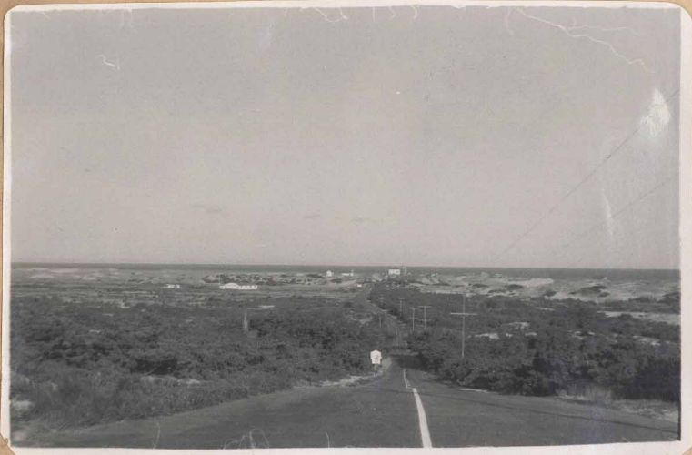
Only change in Sept. 1953 is Airport, left

airport - there is a way back see page ahead