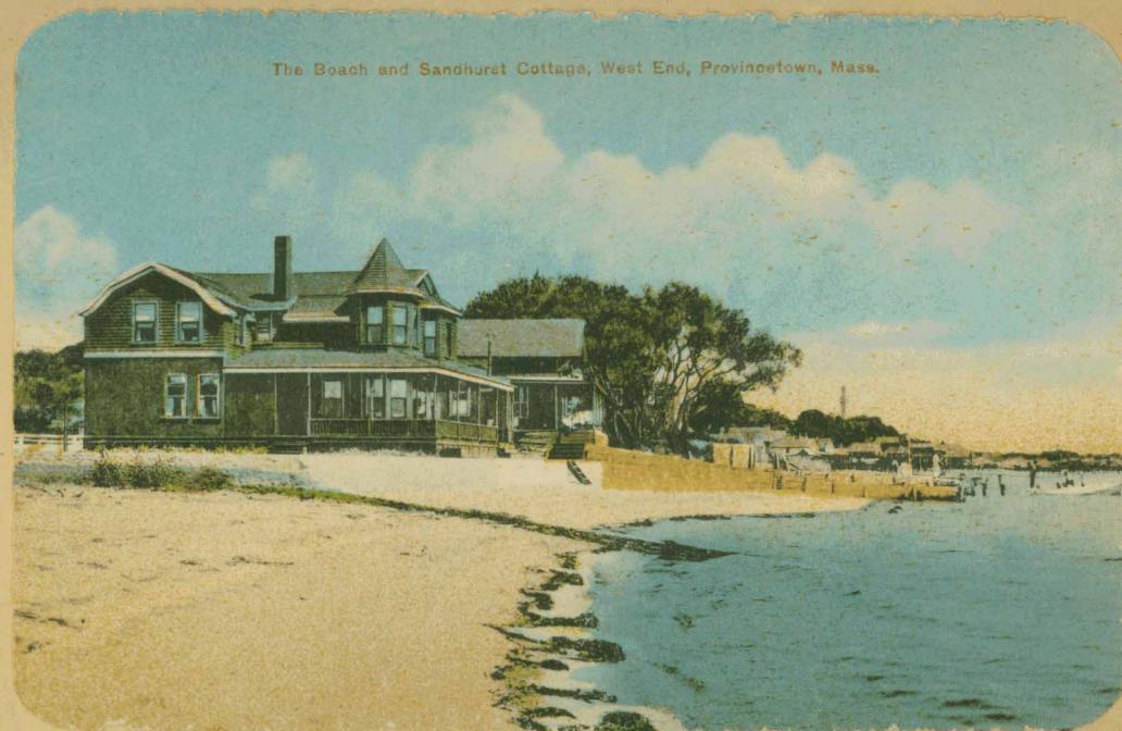
The Beach and Sandhurst Cottage, West End, Provincetown, Mass.