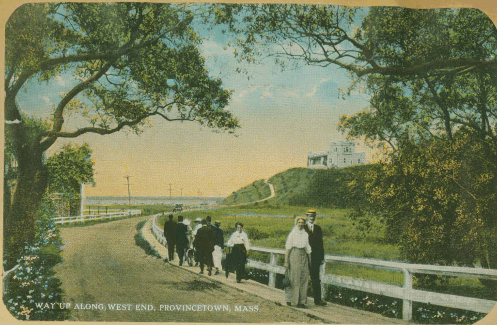
WAY UP ALONG, WEST END, PROVINCETOWN, MASS.