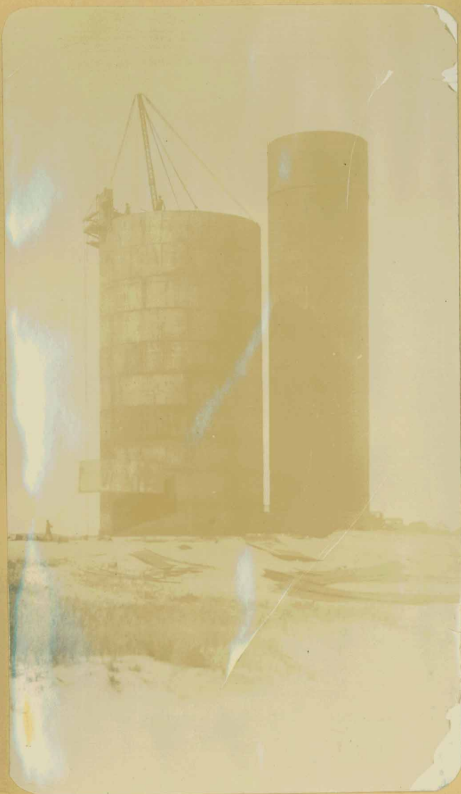
The new standpipe, with the old one beside it. - 1930 -