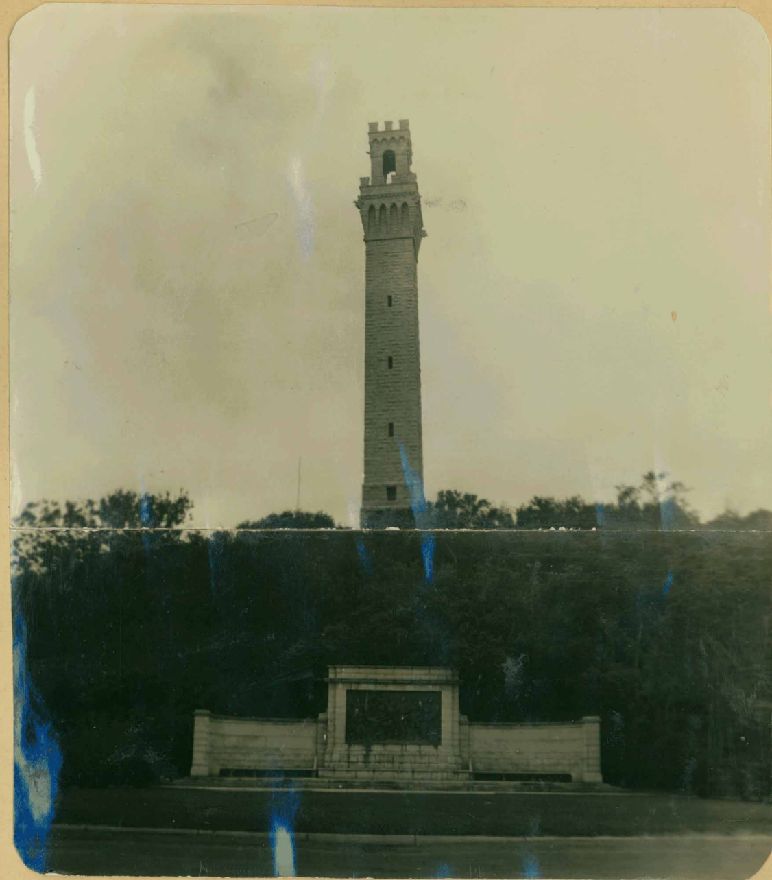
Taken by Althea -- September 1945

ON THE REVERSE IS THE TEXT OF THE COMPACT WITH THE NAMES OF THE SIGNERS.