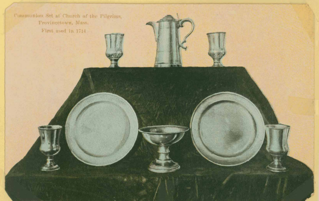
Communion Set at Church of the Pilgrims, Provincetown, Mass. First used in 1714