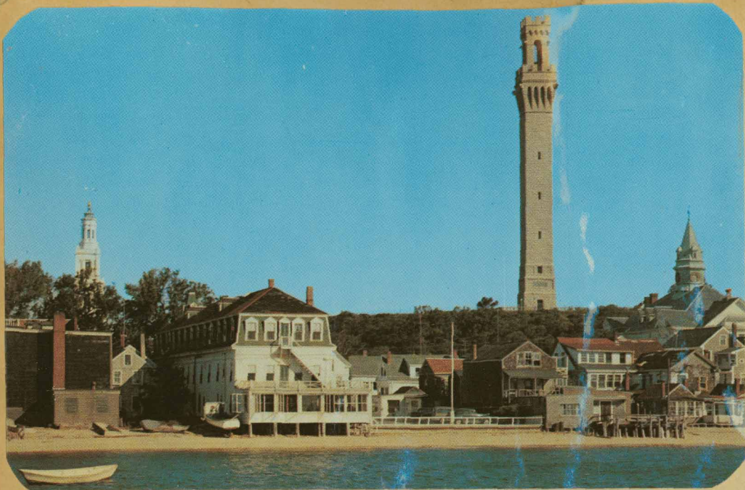
Central House from Colonial Cold Storage Wharf - 1957