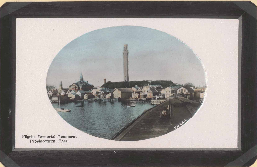
- 1910 -