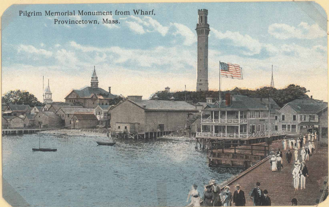
Coming to the Boat - Board of Trade: Flag - 1911 -