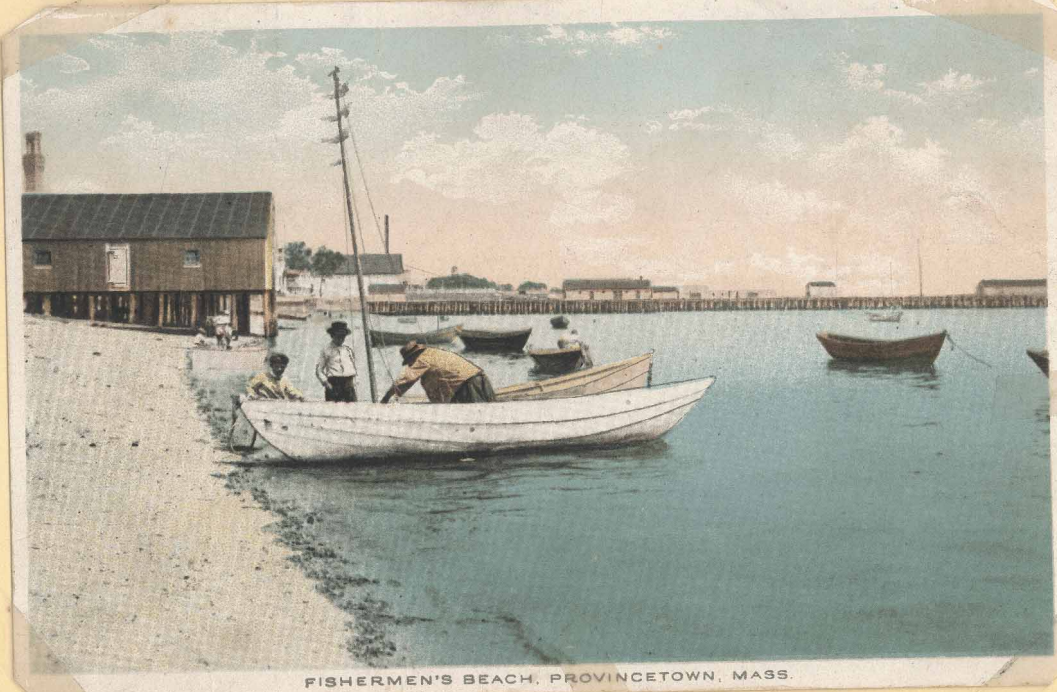
FISHERMEN'S BEACH, PROVINCETOWN, MASS.