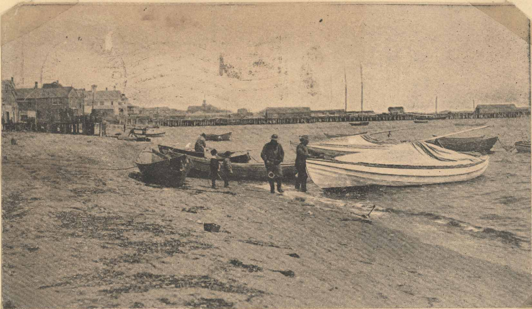
FISHING DORIES ON BEACH