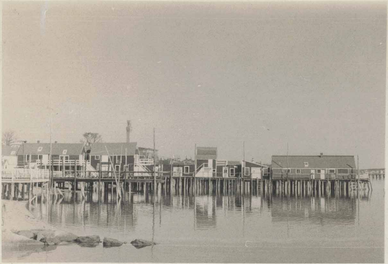
Cap'n Jack's Wharf - Oct. 21, 1956