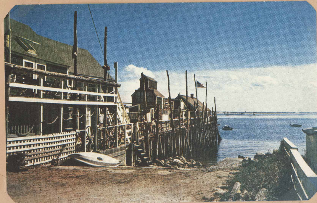
- 1961 -