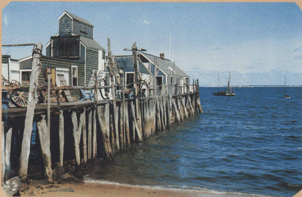
- 1957 -