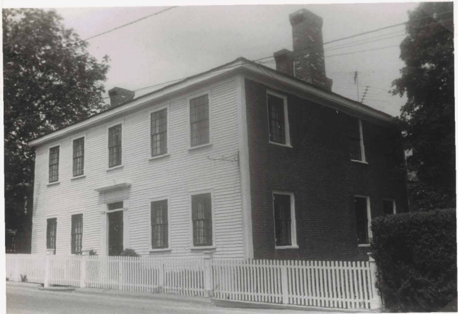
The David Fairbanks House at 90 Bradford Street - - June 13, 1977