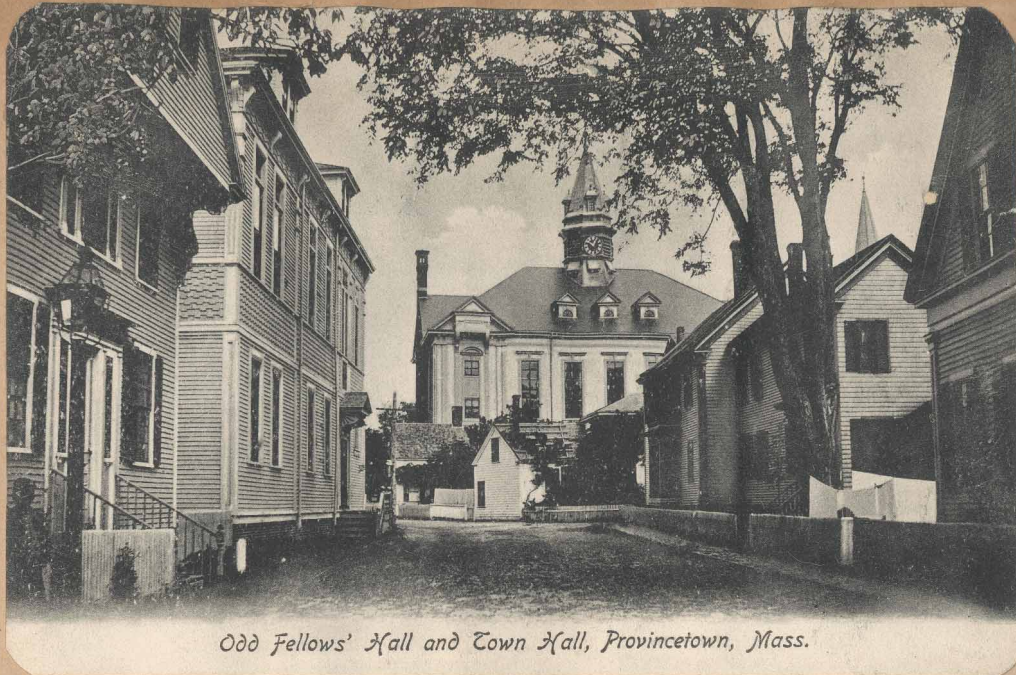
Odd Fellows' Hall and Town Hall, Provincetown, Mass.