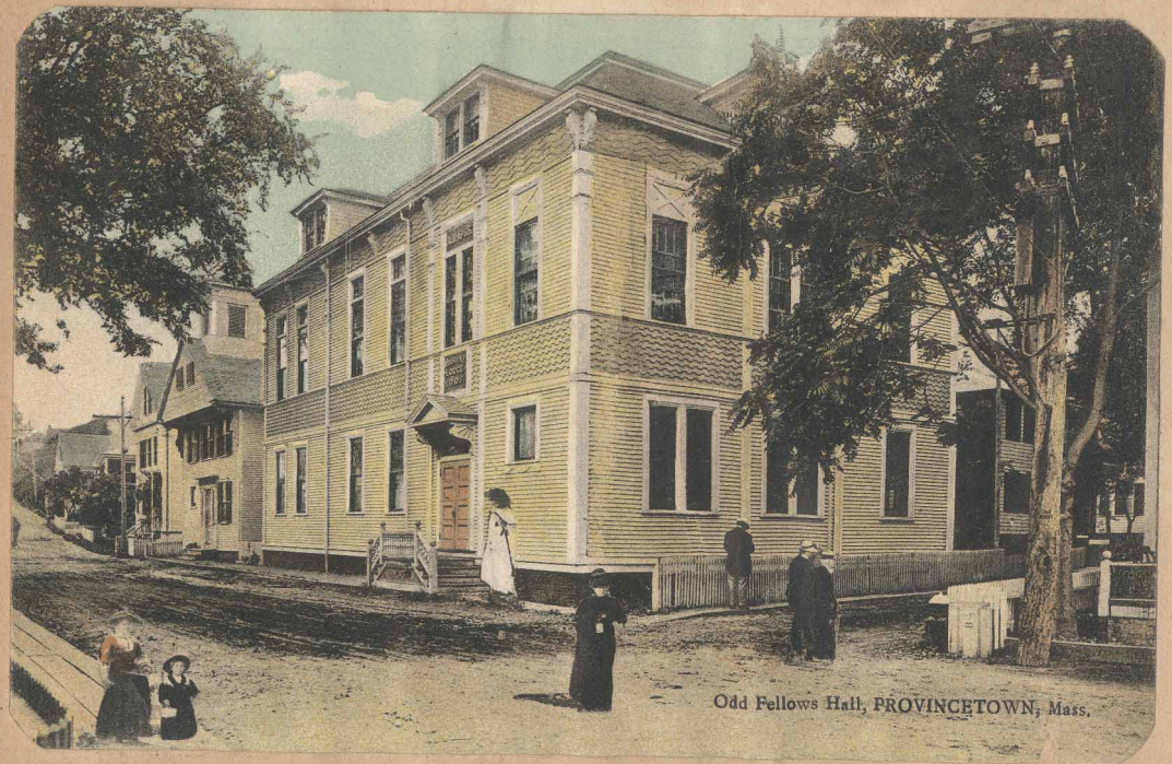
Odd Fellows Hall, PROVINCETOWN, Mass.

Corner of Winslow Street (road to the Monument) Marine Hall next to the I.O.O.F. - About 1900.