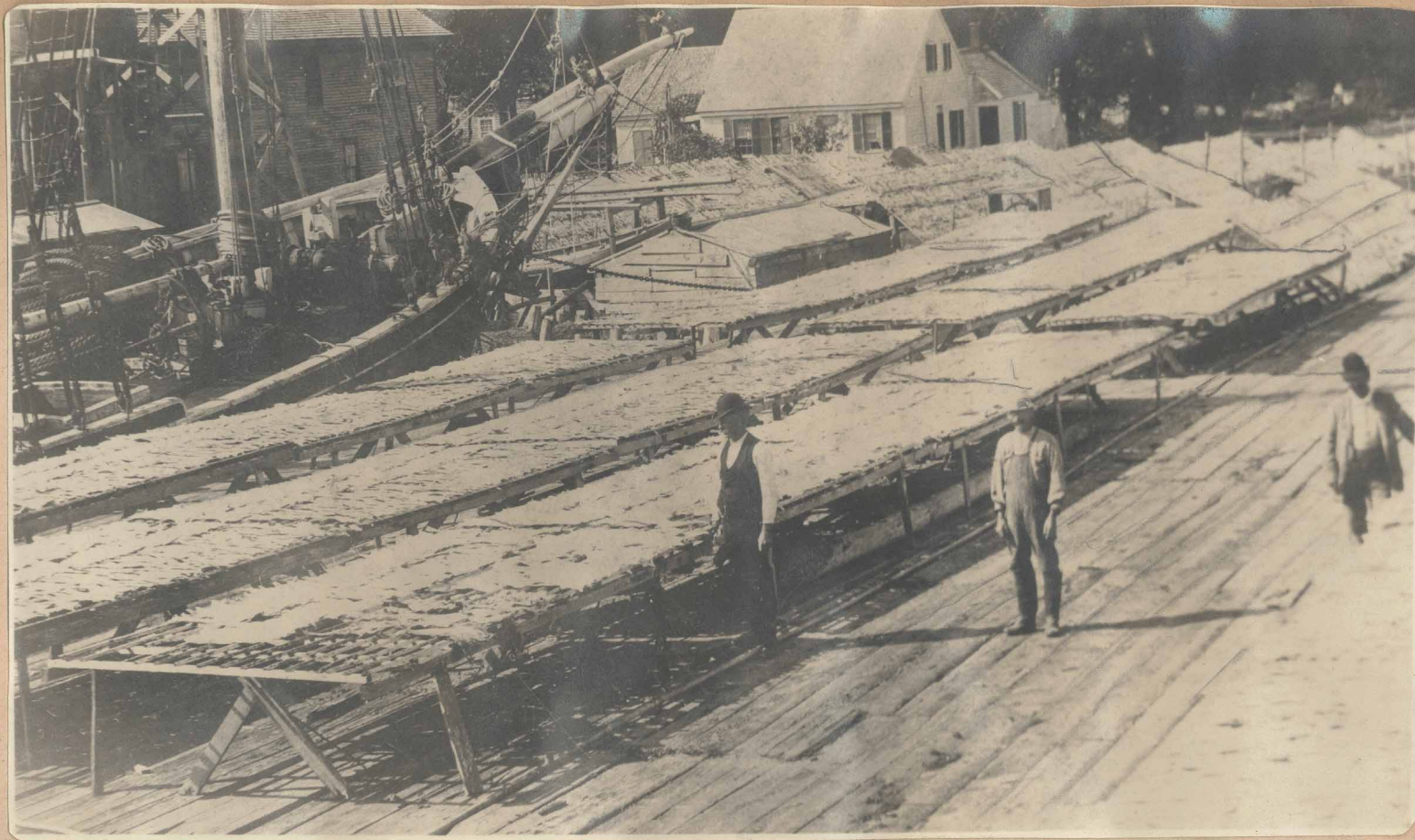
The Philip Whorf pier. The drying of Fish Flakes. Mr. Phil Whorf, left. About 1890

BEFORE the present water-front parking spaces came at Provincetown, they were occupied by fish-flakes, which were wooden racks for drying fish. Sometimes potatoes were planted under the fish-flakes; this combination, when cooked with salt pork scraps, received the popular name of "Cape Cod Turkey." Nova Scotia has its "Digby Chicken" (herring), but Provincetown has its own "Cape Cod turkey," salt fish and potatoes, and a delicious dish it is, when rightly made.