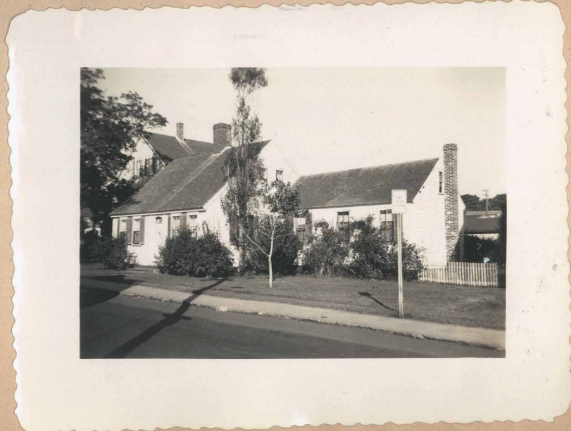
Taken by Aunt Susie - 1941