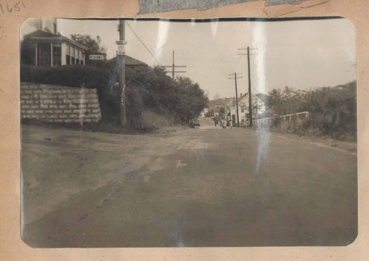
Facing East from Miller Hill. Miller Hill Road, left. - August 1940 -

Let's take a walk up the road & see the Hawthorne Studio