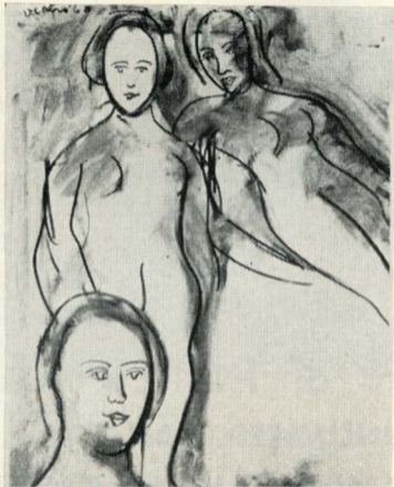
Robert de Niro, Drawing ; at Zabriskie Gallery.