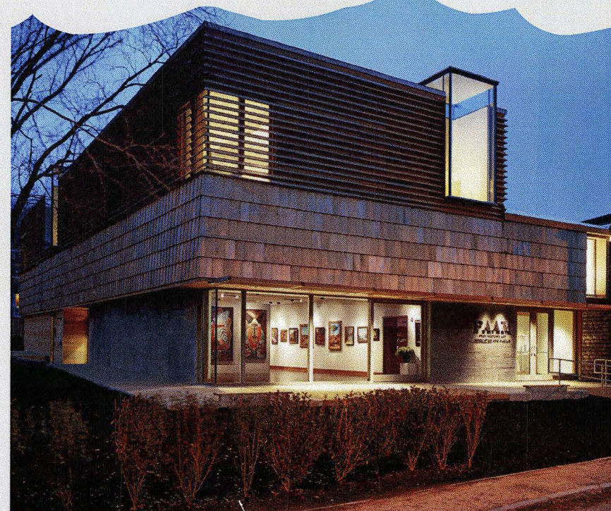
The Provincetown Art Association and Museum

While the styles worn by bathers at the beach change and performance artists and festival costumers reflect latest trends, the legacy of art in Provincetown continues to remain solid. Updated and renovated arts facilities breathe new life into an established tradition. Art walks are an endless journey, as you might expect from America's most celebrated art colony. This is Provincetown, where one constant remains – against this backdrop you find a town obsessed with art.