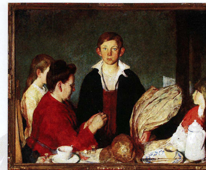
Charles Hawthorne, His First Voyage

Artistic excellence is the hallmark of the Fine Arts Work Center, which awards fellowships to talented young artists and writers. Fellows receive a studio, living space and a small stipend. Past Fellows have won nearly every major national award, including the Pulitzer, MacArthur, Whiting, Pollock-Krasner, Tiffany, Prix de Rome, Guggenheim, NEA, and the National Book Award.