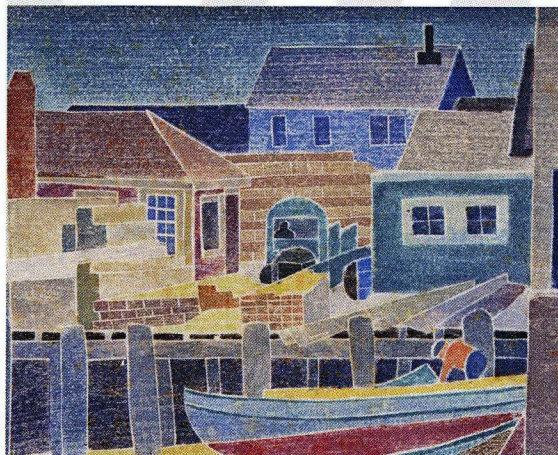
Blanche Lazzell, Untitled Town of Provincetown collection

As America's oldest, continuous art colony, Provincetown boasts 60 art galleries in a town of 3,000 residents. Not only do the arts thrive, the town is often defined by art, performance and creativity. Surrounded by water, artists of every stripe are drawn to this three-square mile creative zone by the special light and aura of free expression.