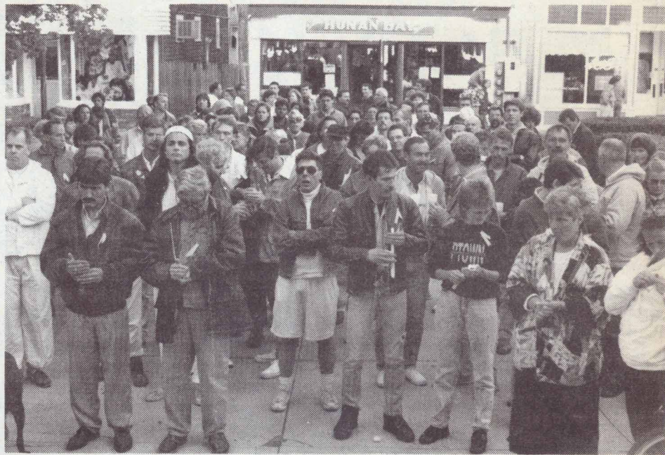
The AIDS candlelight vigil, May 19 in front of the Provincetown Town Hall, sponsored by the Provincetown AIDS Support Group.