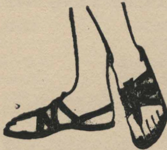
"The Raymond Duncan"

This sandal made from select quality leather with the skill gained through fifty years of research and producing fine handcraft.